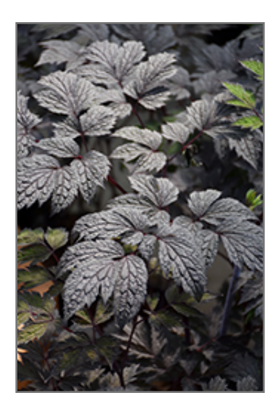
Chocoholic Bugbane foliage