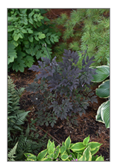
Chocoholic Bugbane