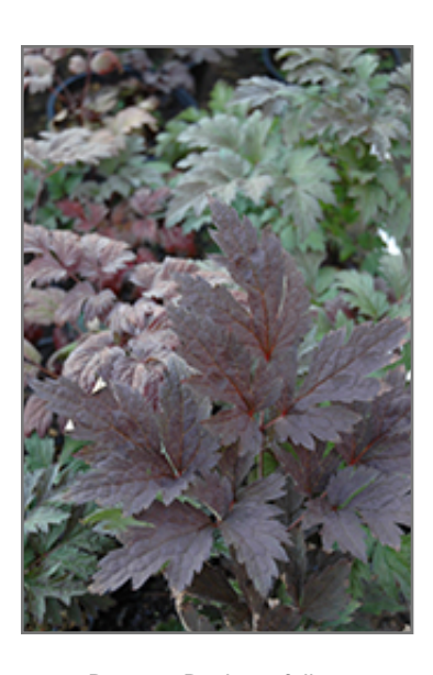
Brunette Bugbane foliage

Brunette Bugbane is blanketed in stunning spikes of fragrant white flowers with shell pink overtones rising above the foliage from mid to late summer. The flowers are excellent for cutting. Its attractive deeply cut compound leaves emerge burgundy in spring, turning dark green in colour with showy burgundy variegation and tinges of dark brown throughout the season. The brown fruits are carried on spikes from late summer to late winter. The deep purple stems are very colorful and add to the overall interest of the plant.