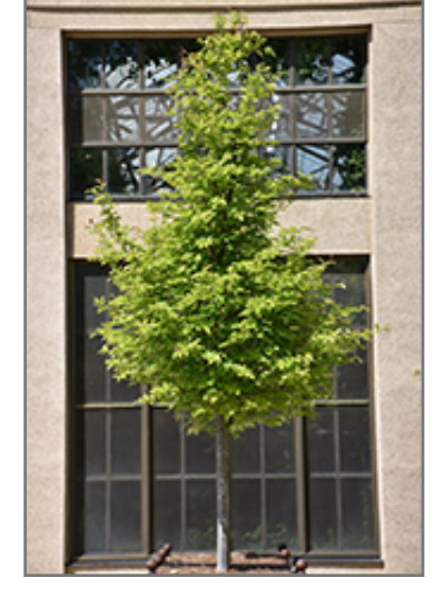
Persian Parrotia