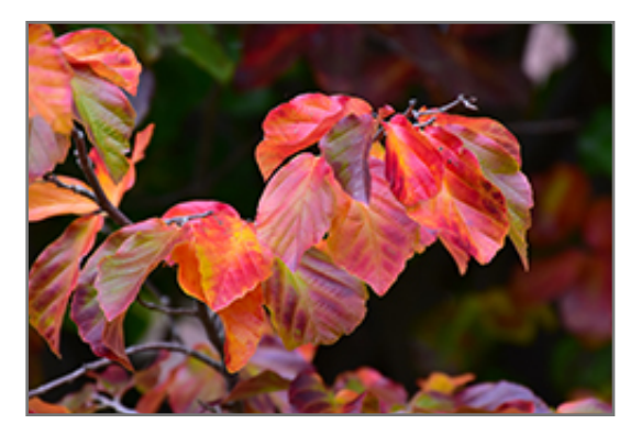
Persian Parrotia in fall