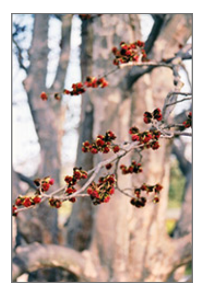
Persian Parrotia flowers

This tree should only be grown in full sunlight. It is very adaptable to both dry and moist locations, and should do just fine under average home landscape conditions. It is not particular as to soil type or pH. It is highly tolerant of urban pollution and will even thrive in inner city environments. This species is not originally from North America.