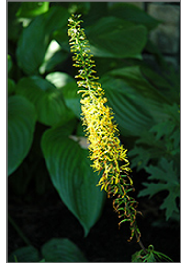
Rayflower flowers

Rayflower will grow to be about 24 inches tall at maturity extending to 4 feet tall with the flowers, with a spread of 32 inches. It grows at a medium rate, and under ideal conditions can be expected to live for approximately 20 years. As an herbaceous perennial, this plant will usually die back to the crown each winter, and will regrow from the base each spring. Be careful not to disturb the crown in late winter when it may not be readily seen!