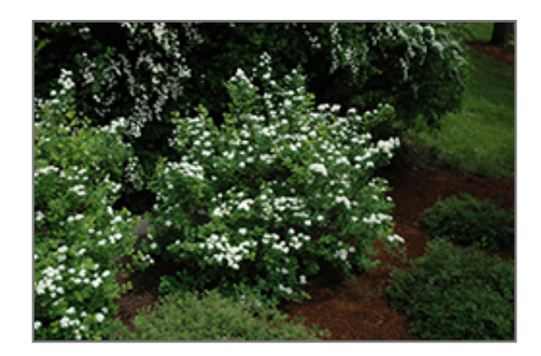
White Frost Spirea in bloom

White Frost Spirea is recommended for the following landscape applications;