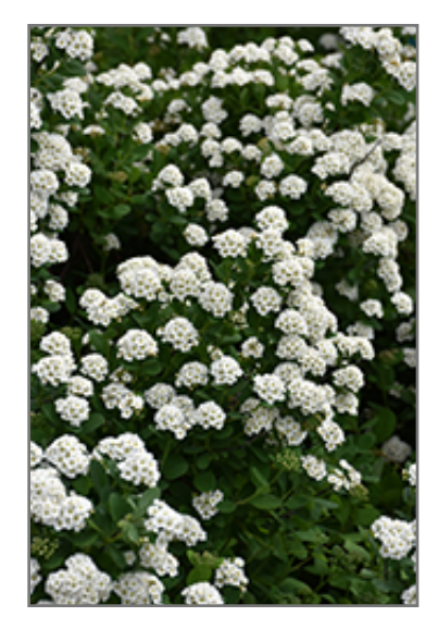
White Frost Spirea flowers

This is a relatively low maintenance shrub, and is best pruned in late winter once the threat of extreme cold has passed. It is a good choice for attracting butterflies to your yard, but is not particularly attractive to deer who tend to leave it alone in favor of tastier treats. It has no significant negative characteristics.