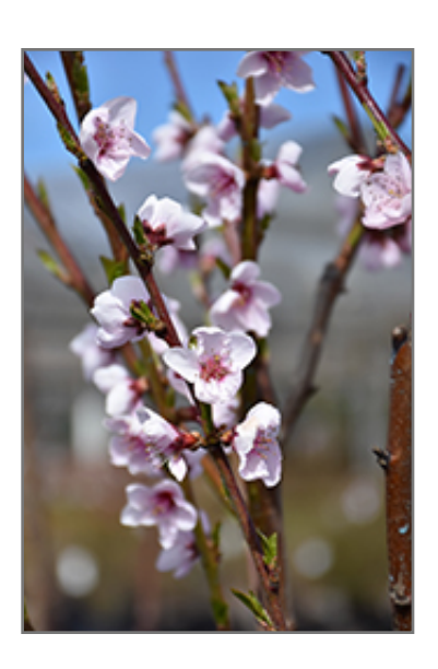
Sunglo Nectarine (dwarf) flowers

Sunglo Nectarine (dwarf) is draped in stunning clusters of fragrant pink flowers along the branches in early spring, which emerge from distinctive rose flower buds before the leaves. It has dark green deciduous foliage. The narrow leaves turn yellow in fall. The fruits are showy yellow drupes with a red blush, which are carried in abundance in mid summer. The fruit can be messy if allowed to drop on the lawn or walkways, and may require occasional clean-up.