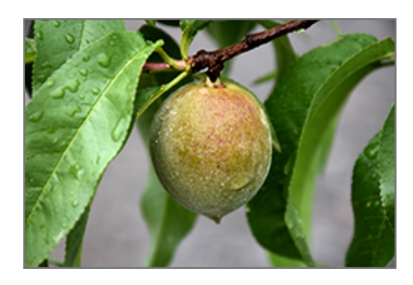
June Gold Peach fruit

June Gold Peach is clothed in stunning clusters of fragrant pink flowers along the branches in early spring, which emerge from distinctive rose flower buds before the leaves. It has dark green deciduous foliage. The narrow leaves turn yellow in fall. The fruits are showy yellow drupes with a red blush, which are carried in abundance in mid summer. The fruit can be messy if allowed to drop on the lawn or walkways, and may require occasional clean-up.