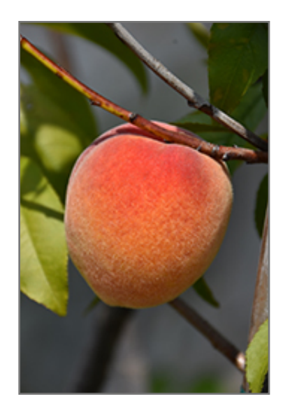
Dixie Red Peach fruit

Dixie Red Peach is smothered in stunning clusters of fragrant pink flowers along the branches in early spring, which emerge from distinctive rose flower buds before the leaves. It has dark green deciduous foliage. The narrow leaves turn yellow in fall. The fruits are showy buttery yellow drupes with a red blush, which are carried in abundance in mid summer. The fruit can be messy if allowed to drop on the lawn or walkways, and may require occasional clean-up.