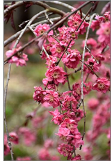
Crimson Cascade Weeping Peach flowers