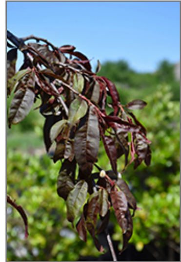
Crimson Cascade Weeping Peach foliage

This tree should only be grown in full sunlight. It does best in average to evenly moist conditions, but will not tolerate standing water. It is not particular as to soil type or pH. It is highly tolerant of urban pollution and will even thrive in inner city environments, and will benefit from being planted in a relatively sheltered location. This is a selected variety of a species not originally from North America.