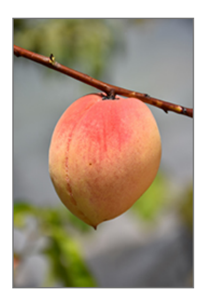
Belle Of Georgia Peach fruit

Belle Of Georgia Peach is smothered in stunning clusters of fragrant pink flowers along the branches in early spring, which emerge from distinctive rose flower buds before the leaves. It has dark green deciduous foliage. The narrow leaves turn yellow in fall. The fruits are showy buttery yellow drupes with a scarlet blush, which are carried in abundance in mid summer. The fruit can be messy if allowed to drop on the lawn or walkways, and may require occasional clean-up.