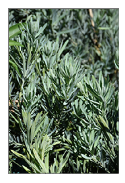
Breede River Yellowwood foliage

Breede River Yellowwood is recommended for the following landscape applications;