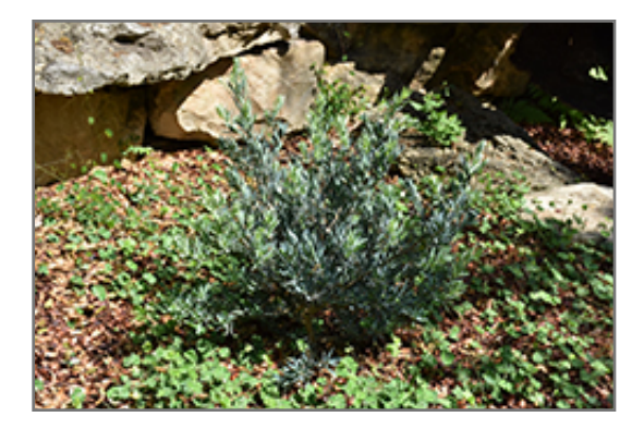
Breede River Yellowwood

Breede River Yellowwood will grow to be about 20 feet tall at maturity, with a spread of 20 feet. It has a low canopy with a typical clearance of 1 foot from the ground, and is suitable for planting under power lines. It grows at a slow rate, and under ideal conditions can be expected to live for 50 years or more.