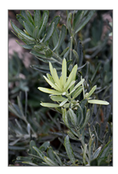
Breede River Yellowwood foliage