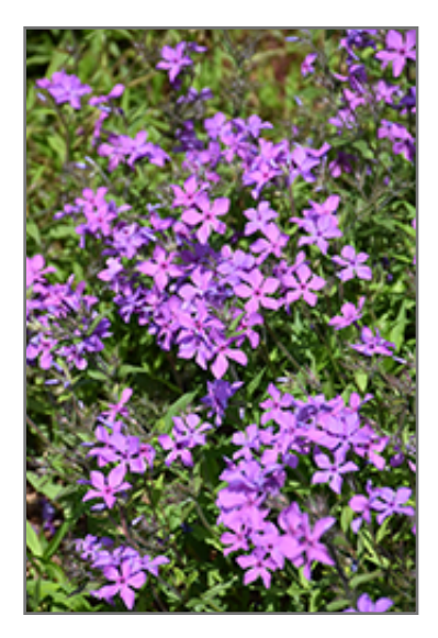
Paparazzi Jagger Phlox flowers

Vibrant springtime blooms of fragrant lavender and hot pink flowers with deep fuchsia centers, on plants with low, spreading habits; suitable for containers or small perennial borders; good mildew resistance