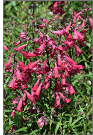
MissionBells Deep Rose Beard Tongue flowers

MissionBells Deep Rose Beard Tongue is recommended for the following landscape applications;