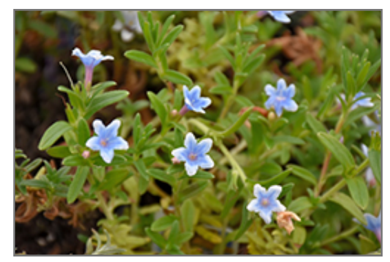
Heavenly Blue Lithodora flowers