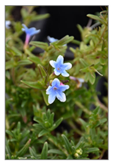
Heavenly Blue Lithodora flowers

Heavenly Blue Lithodora is recommended for the following landscape applications;