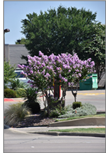
Tropical Purple Crapemyrtle in bloom

Tropical Purple Crapemyrtle will grow to be about 25 feet tall at maturity, with a spread of 10 feet. It has a low canopy with a typical clearance of 3 feet from the ground, and is suitable for planting under power lines. It grows at a fast rate, and under ideal conditions can be expected to live for approximately 30 years.