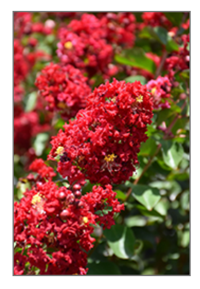
Colorama Scarlet Crapemyrtle flowers