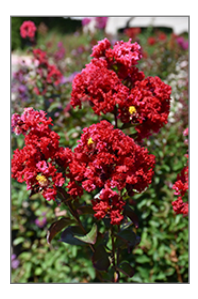
Colorama Scarlet Crapemyrtle flowers