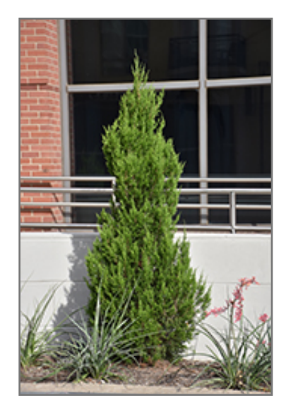
Emerald Feather Juniper