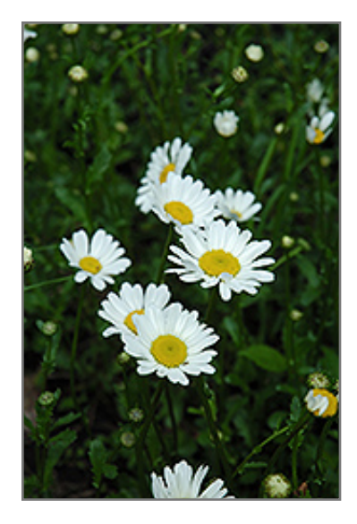
Sedgewick Shasta Daisy flowers

Sedgewick Shasta Daisy has masses of beautiful white daisy flowers with yellow eyes at the ends of the stems from early to late summer, which are most effective when planted in groupings. The flowers are excellent for cutting. Its serrated narrow leaves remain dark green in colour throughout the season.