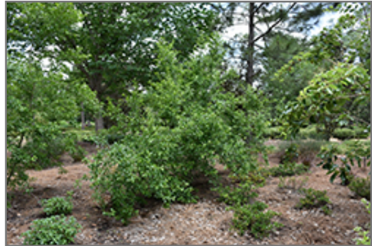
Parson's Pride Possumhaw Holly

Other Names: Possum Haw, Deciduous Holly, Swamp Holly