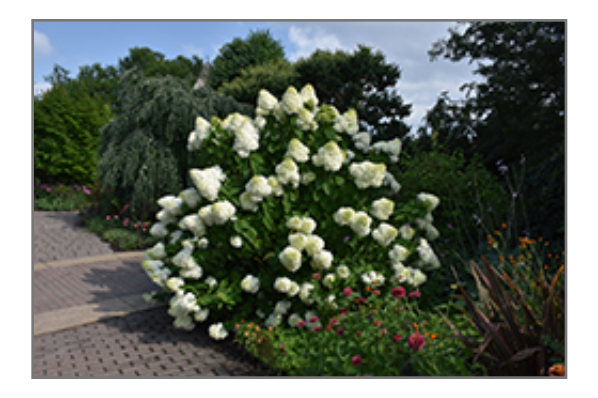
Low Tide Hydrangea in bloom

This shrub will require occasional maintenance and upkeep, and is best pruned in late winter once the threat of extreme cold has passed. It has no significant negative characteristics.