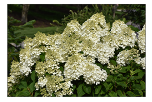
Low Tide Hydrangea flowers

Low Tide Hydrangea is a multi-stemmed deciduous shrub with an upright spreading habit of growth. Its relatively coarse texture can be used to stand it apart from other landscape plants with finer foliage.