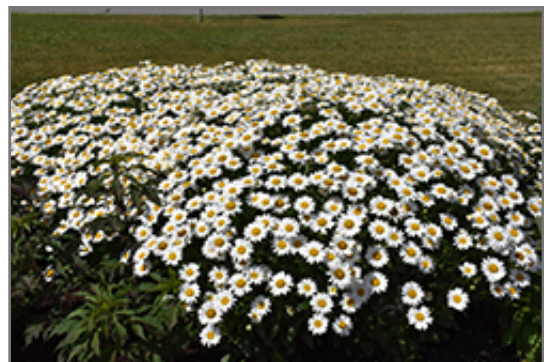
Becky Shasta Daisy in bloom