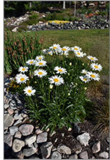
Becky Shasta Daisy in bloom

Becky Shasta Daisy is a fine choice for the garden, but it is also a good selection for planting in outdoor pots and containers. Because of its height, it is often used as a 'thriller' in the 'spiller-thriller-filler' container combination; plant it near the center of the pot, surrounded by smaller plants and those that spill over the edges. It is even sizeable enough that it can be grown alone in a suitable container. Note that when growing plants in outdoor containers and baskets, they may require more frequent waterings than they would in the yard or garden. Be aware that in our climate, most plants cannot be expected to survive the winter if left in containers outdoors, and this plant is no exception. Contact our experts for more information on how to protect it over the winter months.