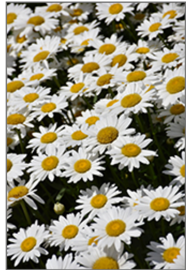
Becky Shasta Daisy flowers