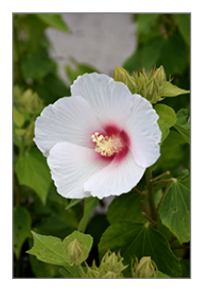
Big Hit White Hibiscus flowers

Large, vivid white flowers with deep pink throats in late summer to fall; ideal for the mixed garden border or in mass plantings; has very disease resistant foliage; beware of Japanese Beetles; do not allow to dry to wilting point