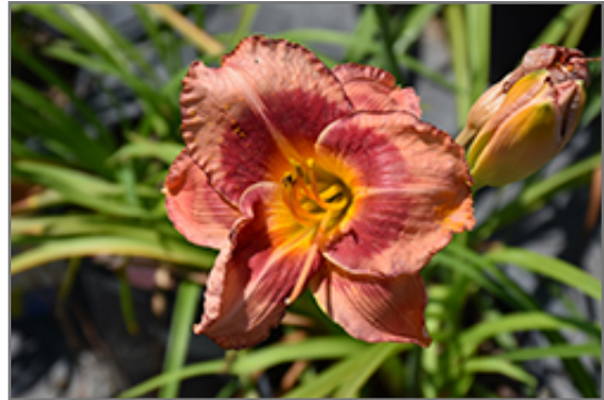
Bahama Pink Sky Kokomo Daylily flowers