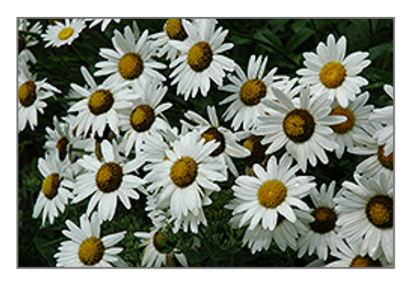
Alaska Shasta Daisy flowers