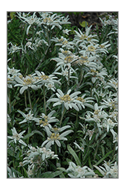
Alpine Edelweiss flowers

This plant does best in full sun to partial shade. It prefers dry to average moisture levels with very well-drained soil, and will often die in standing water. It is considered to be drought-tolerant, and thus makes an ideal choice for a low-water garden or xeriscape application. It is particular about its soil conditions, with a strong preference for poor, alkaline soils. It is somewhat tolerant of urban pollution. This species is not originally from North America. It can be propagated by division.