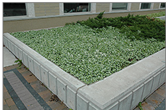
White Nancy Spotted Dead Nettle in bloom