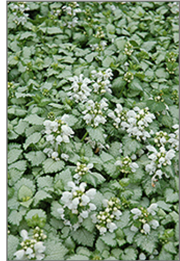
White Nancy Spotted Dead Nettle flowers