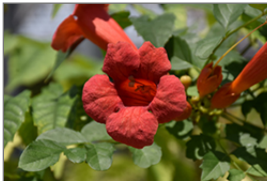
Tango Trumpetvine flowers