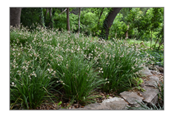
St. Bernard's Lily in bloom