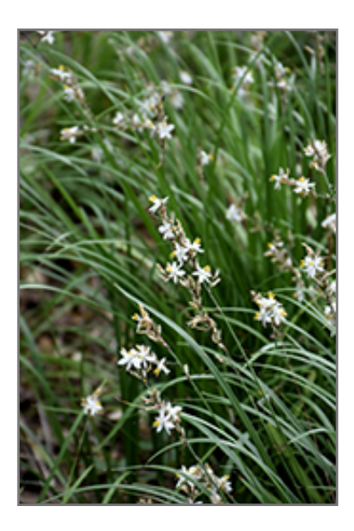
St. Bernard's Lily flowers

St. Bernard's Lily is recommended for the following landscape applications;