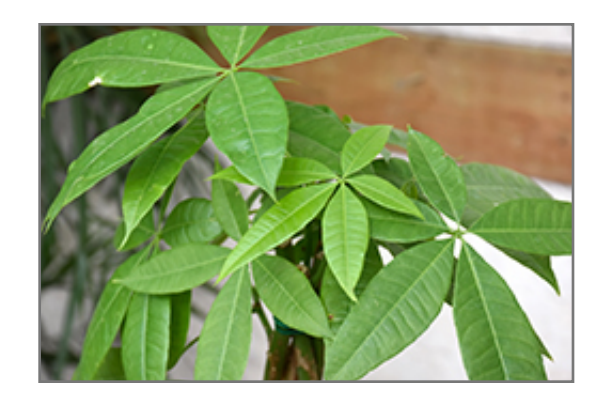
Money Tree foliage