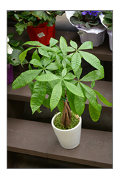
Money Tree in full

This is a multi-stemmed evergreen houseplant with an upright spreading habit of growth. Its relatively coarse texture stands it apart from other indoor plants with finer foliage. This plant can be pruned at any time to keep it looking its best.