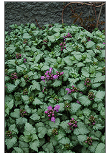
Red Nancy Spotted Dead Nettle in bloom