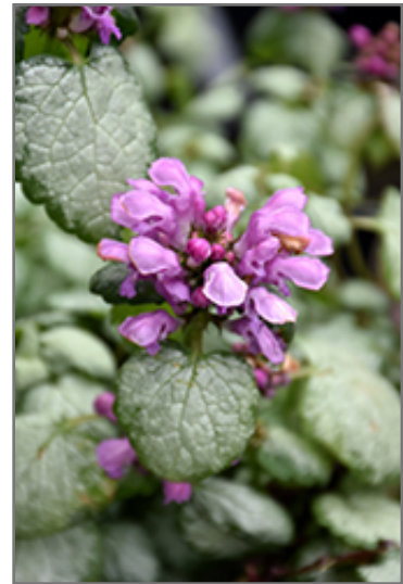
Red Nancy Spotted Dead Nettle flowers