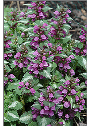
Chequers Spotted Dead Nettle flowers