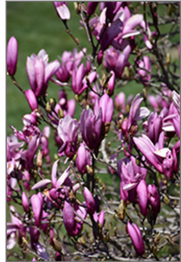
Ann Magnolia flowers

This shrub does best in full sun to partial shade. It requires an evenly moist well-drained soil for optimal growth, but will die in standing water. It is not particular as to soil type, but has a definite preference for acidic soils. It is quite intolerant of urban pollution, therefore inner city or urban streetside plantings are best avoided. Consider applying a thick mulch around the root zone in winter to protect it in exposed locations or colder microclimates. This particular variety is an interspecific hybrid.