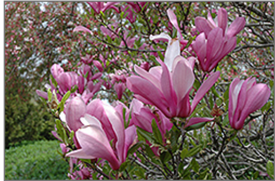
Ann Magnolia flowers

Ann Magnolia is recommended for the following landscape applications;