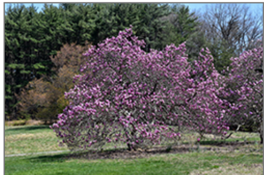
Ann Magnolia in bloom