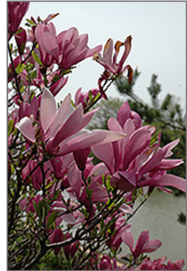
Ann Magnolia flowers