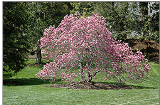
Ann Magnolia in bloom