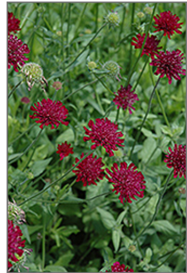
Crimson Scabious flowers

Crimson Scabious will grow to be about 24 inches tall at maturity extending to 3 feet tall with the flowers, with a spread of 24 inches. It tends to be leggy, with a typical clearance of 1 foot from the ground, and should be underplanted with lower-growing perennials. It grows at a fast rate, and under ideal conditions can be expected to live for approximately 3 years. As an herbaceous perennial, this plant will usually die back to the crown each winter, and will regrow from the base each spring. Be careful not to disturb the crown in late winter when it may not be readily seen!