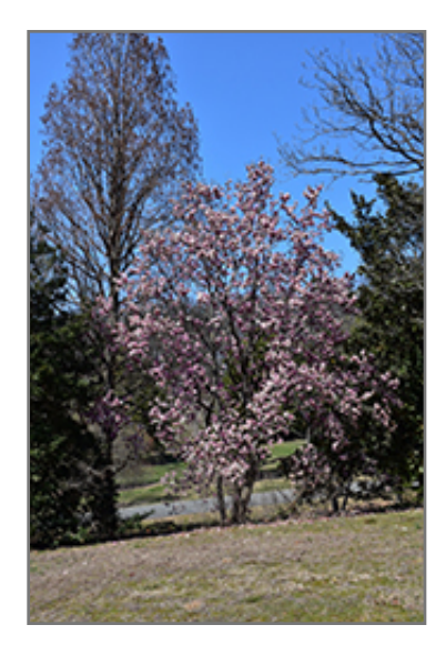
Sundew Saucer Magnolia in bloom