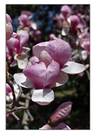
Sundew Saucer Magnolia flowers