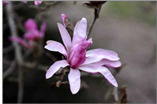
Rubra Red Star Magnolia flowers

Rubra Red Star Magnolia is recommended for the following landscape applications;