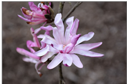
Rubra Red Star Magnolia flowers