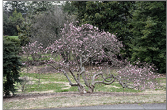
Rubra Red Star Magnolia in bloom

This shrub does best in full sun to partial shade. It requires an evenly moist well-drained soil for optimal growth, but will die in standing water. It is not particular as to soil type, but has a definite preference for acidic soils. It is quite intolerant of urban pollution, therefore inner city or urban streetside plantings are best avoided, and will benefit from being planted in a relatively sheltered location. Consider applying a thick mulch around the root zone in winter to protect it in exposed locations or colder microclimates. This is a selected variety of a species not originally from North America.