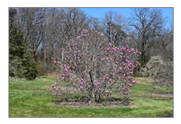
Orchid Magnolia in bloom