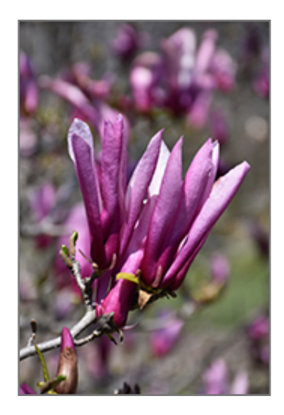
Orchid Magnolia flowers