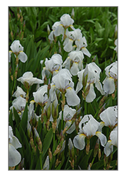
Florentina Bearded Iris flowers