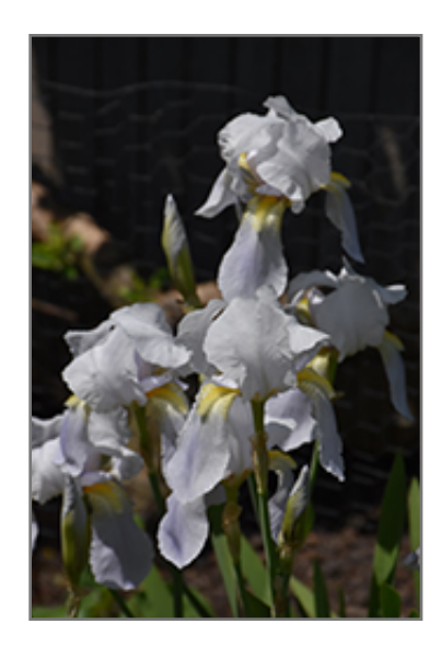
Florentina Bearded Iris flowers