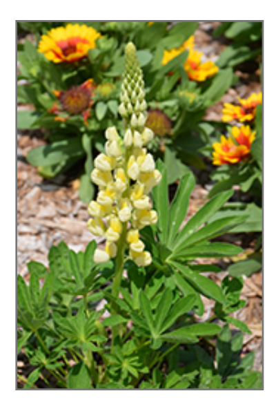
Lupini Yellow Shades Lupine flowers

Lupini Yellow Shades Lupine is recommended for the following landscape applications;