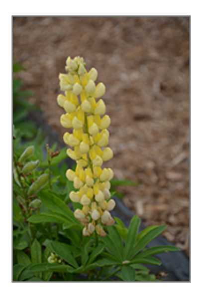
Lupini Yellow Shades Lupine flowers