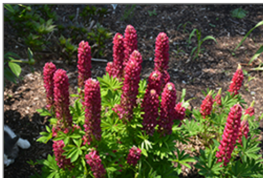
Mini Gallery Red Lupine in bloom