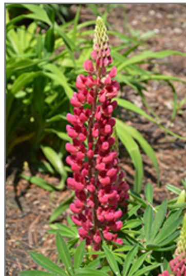
Mini Gallery Red Lupine flowers