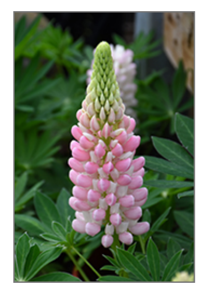
Mini Gallery Pink Bicolor Lupine flowers

This plant will require occasional maintenance and upkeep, and should be cut back in late fall in preparation for winter. It is a good choice for attracting hummingbirds to your yard, but is not particularly attractive to deer who tend to leave it alone in favor of tastier treats. Gardeners should be aware of the following characteristic(s) that may warrant special consideration;