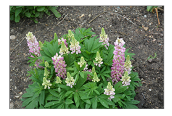
Mini Gallery Pink Bicolor Lupine in bloom