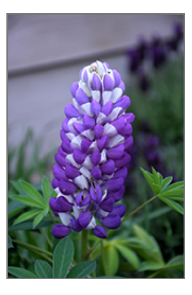
Mini Gallery Blue Bicolor Lupine flowers

A stunning compact hybrid producing thick spikes of eye catching two-tone violet-blue and white flowers; a tremendous visual impact massed in the garden, border plantings or in containers