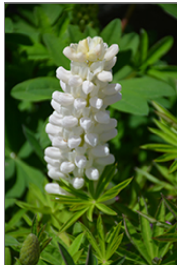
Gallery White Lupine flowers