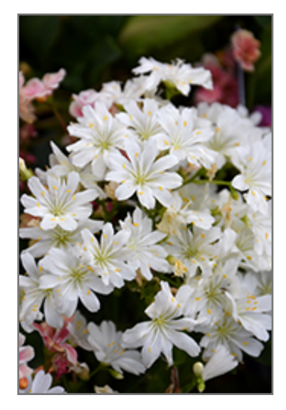
Elise Mixed Bitterroot flowers

This is a high maintenance plant that will require regular care and upkeep, and should not require much pruning, except when necessary, such as to remove dieback. It has no significant negative characteristics.