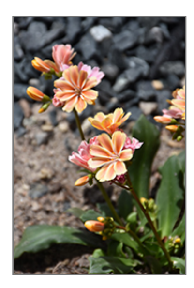
Elise Mixed Bitterroot flowers