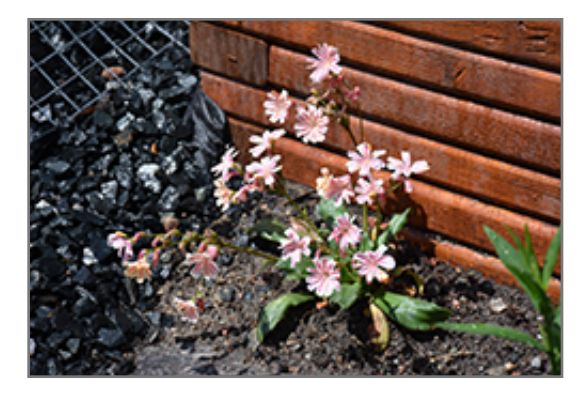
Elise Mixed Bitterroot in bloom

Elise Mixed Bitterroot will grow to be only 4 inches tall at maturity extending to 6 inches tall with the flowers, with a spread of 8 inches. When grown in masses or used as a bedding plant, individual plants should be spaced approximately 5 inches apart. Its foliage tends to remain low and dense right to the ground. It grows at a slow rate, and under ideal conditions can be expected to live for approximately 5 years. As an evegreen perennial, this plant will typically keep its form and foliage year-round.