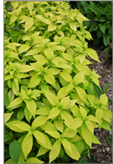
Golden Angel Japanese Shrub Mint foliage