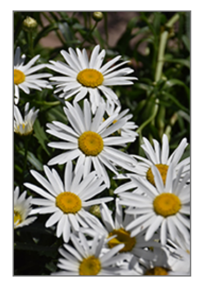
Lucille Grace Shasta Daisy flowers

This plant will require occasional maintenance and upkeep, and should be cut back in late fall in preparation for winter. It is a good choice for attracting butterflies to your yard. Gardeners should be aware of the following characteristic(s) that may warrant special consideration;