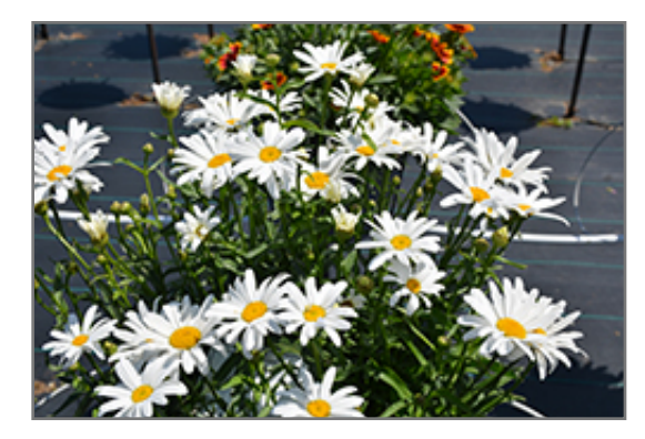
Lucille Grace Shasta Daisy flowers