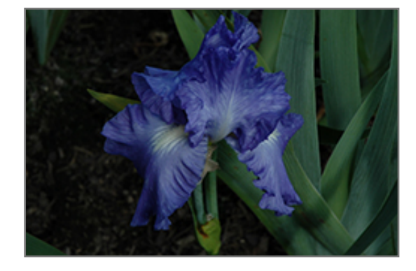
Victoria Falls Iris flowers

Victoria Falls Iris is an herbaceous perennial with an upright spreading habit of growth. Its medium texture blends into the garden, but can always be balanced by a couple of finer or coarser plants for an effective composition.