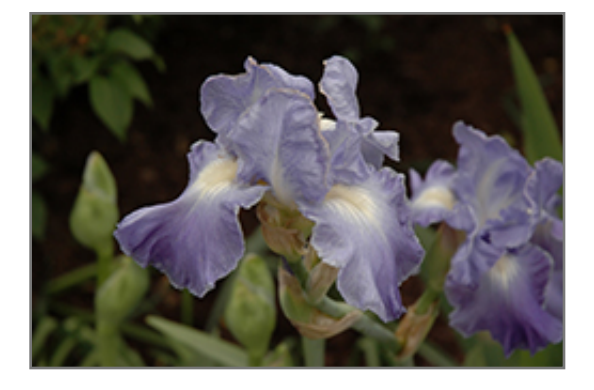
Victoria Falls Iris flowers

This plant does best in full sun to partial shade. It does best in average to evenly moist conditions, but will not tolerate standing water. It is not particular as to soil type or pH. It is somewhat tolerant of urban pollution. This particular variety is an interspecific hybrid. It can be propagated by division; however, as a cultivated variety, be aware that it may be subject to certain restrictions or prohibitions on propagation.