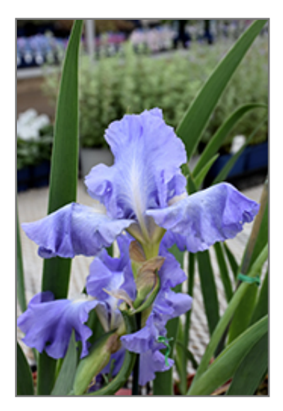
Victoria Falls Iris flowers