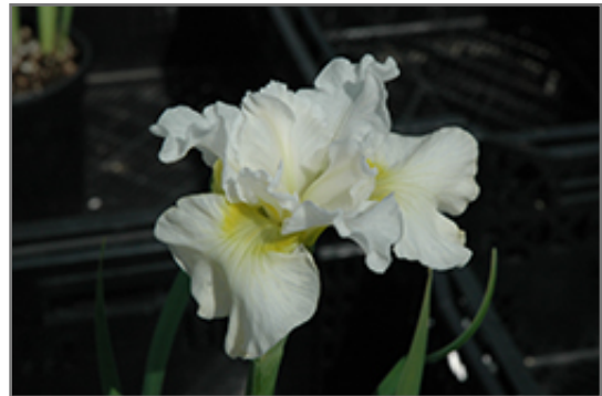
Frilly Vanilly Siberian Iris flowers