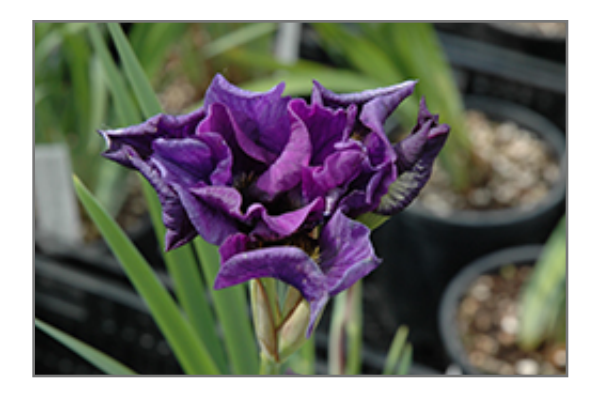
Double Standard Siberian Iris flowers