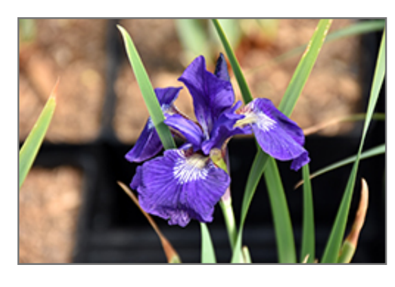
Blue King Siberian Iris flowers

A striking variety presenting violet-blue blooms with falls splashed in white and yellow throats; massed plantings give the best effect in a garden, blooms from late spring into the summer, best in full sun and moist soil but very adaptable