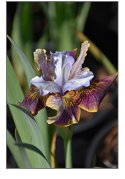
Black Joker Siberian Iris flowers

A striking variety with velvety purple falls trimmed in gold, below lavender standards highlighted in yellow; massed plantings give the best effect in a garden, blooms from late spring into the summer, best in full sun and moist soil but very adaptable